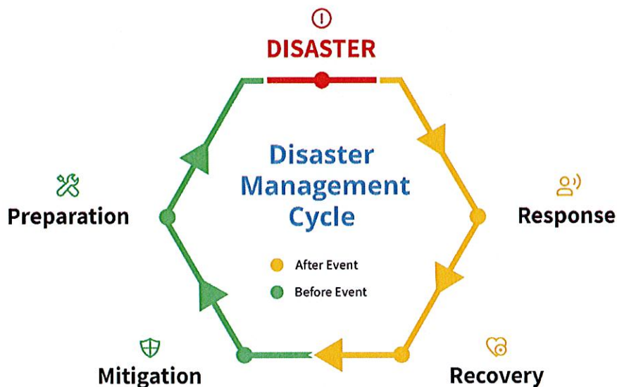
Figure 1. Phases of Disaster Management

This base plan provides an overview of the roles, responsibilities and actions of elected officials, county departments and partner agencies within Adams County. The base plan is then supported by annexes