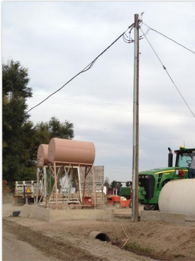
Figure 7. Opportunity for Pollution Prevention Measures at Petrocco Farms