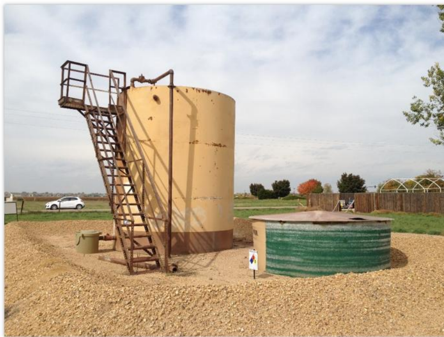
Figure 2. Above-Ground Crude Oil Storage Tank

Site visits included two properties with oil & gas structures upon them. Typically there was one or more pump jack(s) and one above-ground storage tank for crude oil located on the site, (the latter surrounded by bermed gravel – see Figure 2). Some properties had originally been billed for some or all of these areas as part of the stormwater billing for the property. After bills were corrected, the only billable features were storage tanks which complies with the existing billing policy.