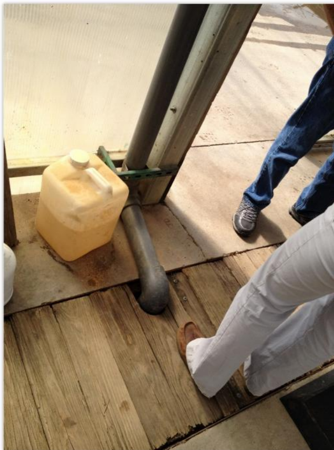
Figure 4. Gutters tied into Underground Drainage System

from other properties. The greenhouses were equipped with drainage tiles under the plant beds and an outdoor reservoir for ditch water (for irrigation, not stormwater collection). Drainage pipes were present under each of the permanent structures, and in many cases gutters were also tied into the system. The drainage tiles primarily serve to move water away from plant roots and drain the plant-growing areas speedily, rather than to provide filtration or water quality treatment. The receiving creek is part of the utility stormwater drainage system. Thus, although these properties and others like them do not necessarily drain through built infrastructure, they do not bypass the storm drainage system. The water that enters the receiving stream is a combination of precipitation runoff and irrigation runoff (from indoor greenhouses). This means that a greater volume of runoff reaches the stream than from a non-irrigated property and that the property arguably places a greater demand upon the system than some other types. Furthermore, it is likely the water leaving the property has higher levels of nutrients than some other properties because of the fact the runoff contains fertilizers that are applied to and then runoff the plants.