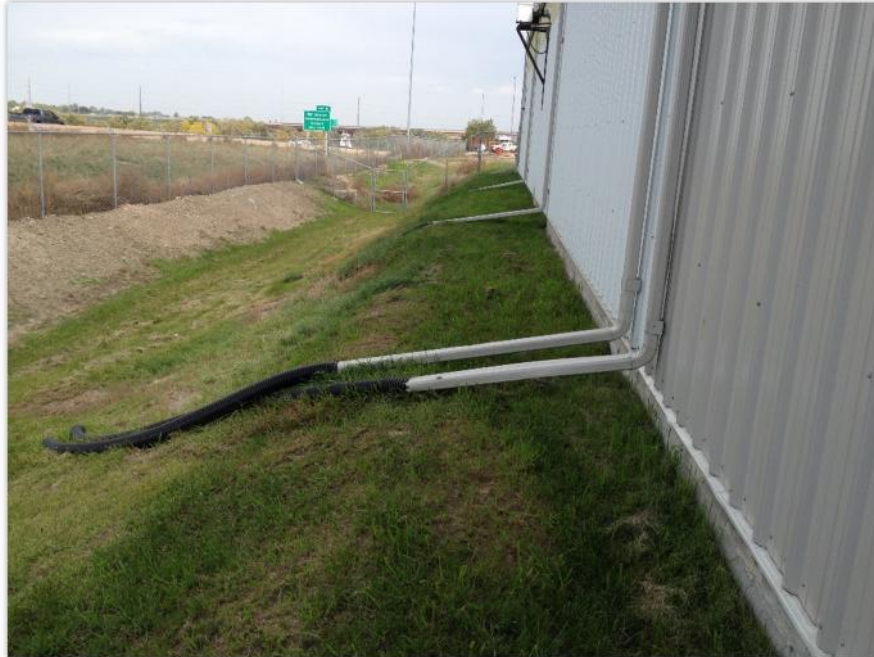
Figure 8. BMP at Spurgeon Enterprises