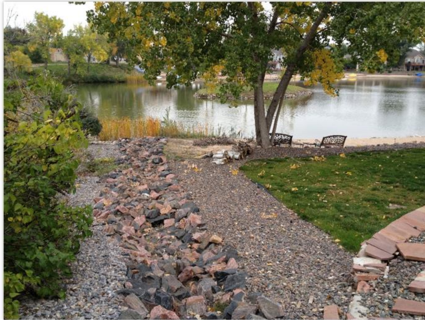
Figure 9. Aloha Beach Drainage to BMP