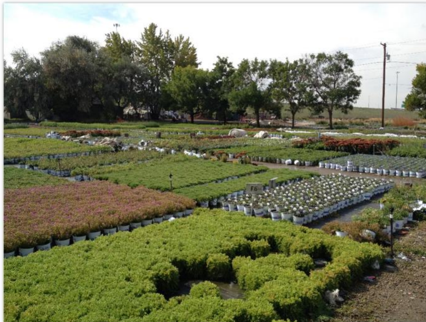
Figure 3. Outdoor Growing Area (uncovered in early fall)

RFC visited two greenhouses (see Figure 3 for photograph of outdoor growing area) in the western portion of the utility service area. Both property owners were concerned about two different elements of their fees. Since aerial imagery was flown during the winter months, much of the greenhouse property was covered in temporary structures that are generally tarped from about November to February of each year (even then the roof tarps are intermittently drawn). These customers did not believe they should be charged as if they were permanent impervious areas. RFC agrees with this analysis. In many cases, utility staff has already worked with the property owners to correctly define their billable impervious areas.