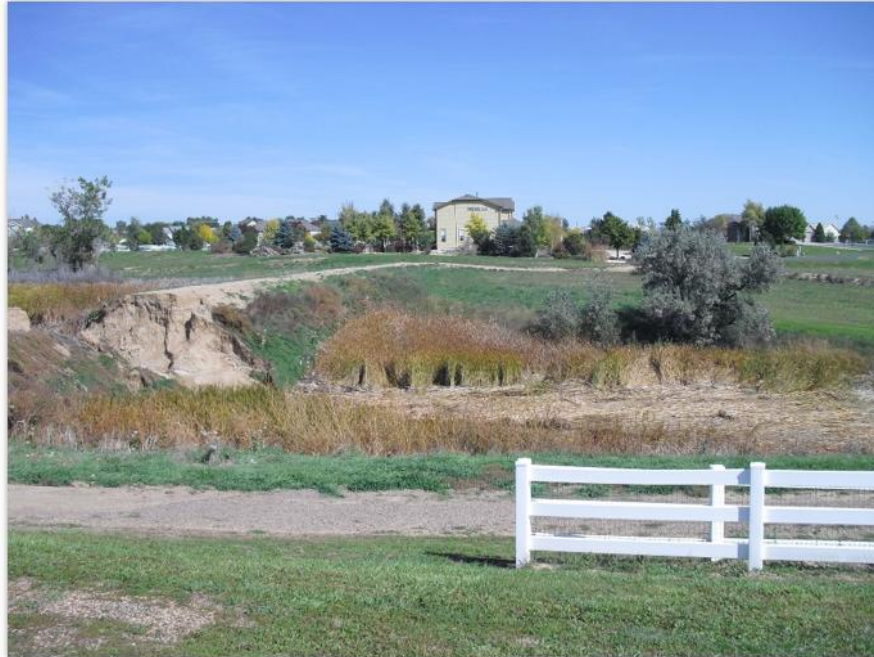
Figure 5. Retention Pond at Todd Creek Farms (see broken levee at left)

Todd Creek Farms, a residential subdivision with many further divisions, is generally made up of large lots with large amounts of on-site impervious area. Infrastructure within the development is limited to culverts and a large retention pond. It is unclear at the time of this report whether a Metropolitan District (discussed in more detail below) is responsible for maintaining this infrastructure. Site visits occurred just weeks after the region's major September 2013 storm, and the infrastructure in this subdivision was badly in need of repair (see Figure 5)..