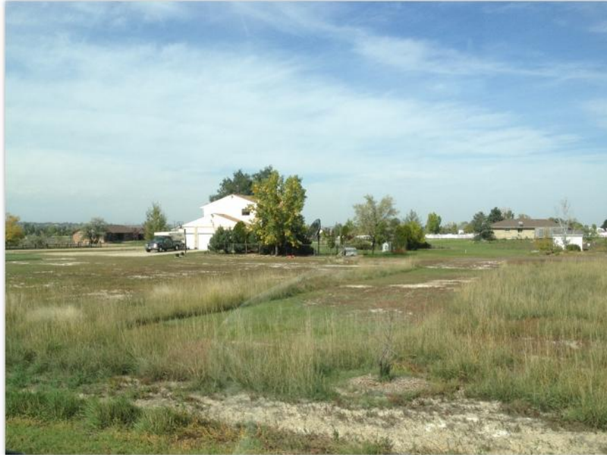
Figure 6. Low Density Lots at Wadley Farms Subdivision

RFC does not recommend implementing a large lot or low development credit in response to the conditions found within these subdivisions. If the County elected to provide a credit to homeowners associations or individual properties in subdivisions for stormwater treatment practices, both subdivisions could be eligible for stormwater treatment credits.