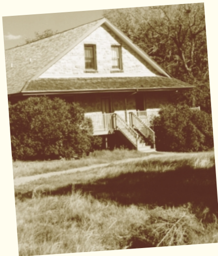
The Rocky Mountain Bird Observatory Stone House at Barr Lake State Park