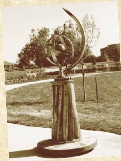
Webster Lake/E.B. Rains Jr. Memorial Park

The Adams County Open Space Sales Tax fund distribution is a great help to the City of Westminster, allowing us to develop much needed park sites in the Adams County portion of the city. Foxshire Park, our latest neighborhood park development, provides our residents with park amenities that include a children's play lot, basketball court, open play areas and trails.