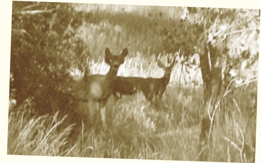
South Platte Wildlife Corridor