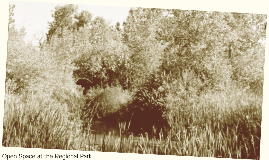
Open Space at the Regional Park

A dams County citizens passed an Open Space Sales Tax on November 2, 1999. The voter-approved issue called for 68 percent of the proceeds from the tax to be distributed to eligible jurisdictions by a grant process. The Open Space Sales Tax issue also provided for 30 percent of the funds to be returned to the cities and county based on where the tax is collected. The remaining 2 percent may be used for administrative purposes.