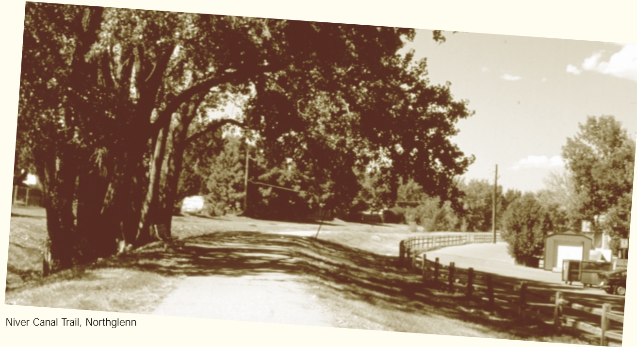
Niver Canal Trail, Northglenn