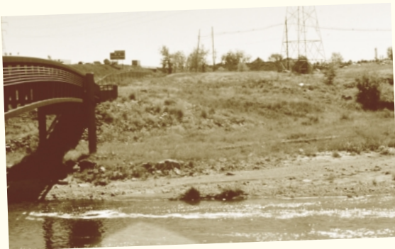
Sand Creek Regional Greenway Trail, Commerce City

$600,000 Purchase fee simple or purchase conservation easements along the South Platte River from Hwy. 7 to 104th Avenue for preservaton of approximately 192 acres. This property will be conserved as a wildlife corridor.