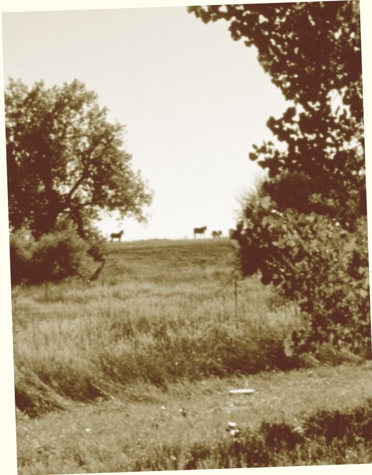
Sand Creek Greenway, Aurora

Following are the grants the Adams County Open Space Advisory Board recommended for funding with sales tax revenues collected in 2001. The Board of County Commissioners approved the recommendations and awarded the grants.