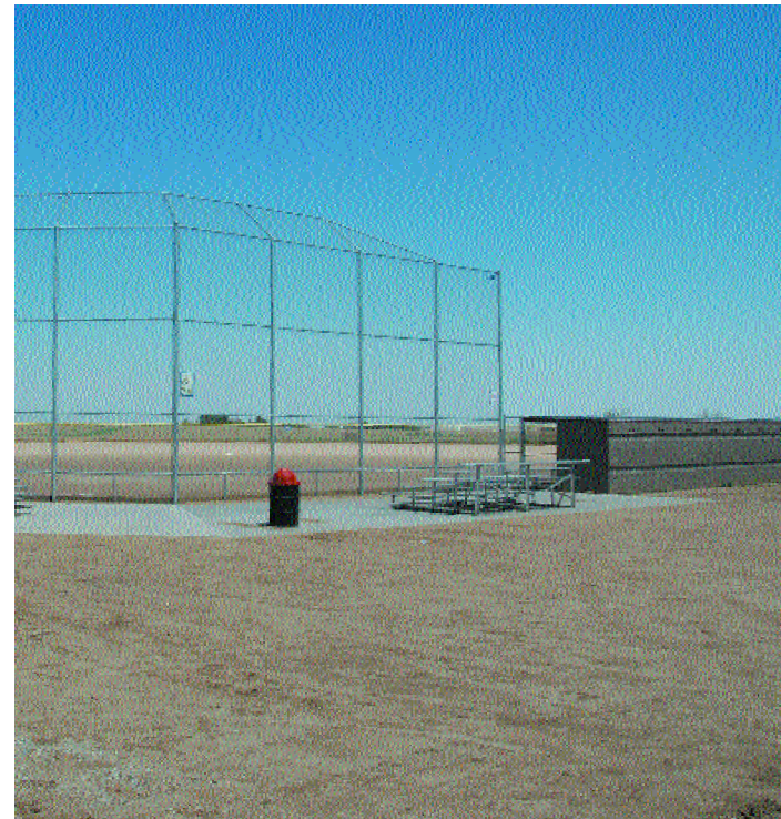
STRASBURG METRO PARKS & RECREATION DISTRICT

This park will include a playground, picnic area, restrooms and a trail that will link to Bennett's future trail system.