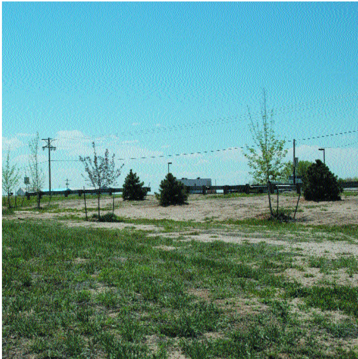
TOWN OF BENNETT Brothers Four Park - $94,831

This park will include a playground, picnic area, restrooms and a trail that will link to Bennett's future trail system.