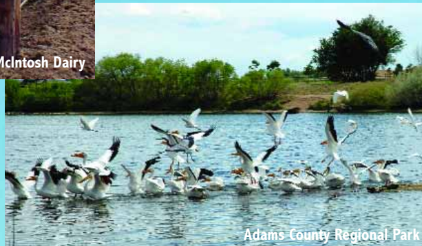
Adams County Regional Park

In 2000, Adams County completed its first conservation easement with the McIntosh Dairy, located on historic Riverdale Road along the South Platte River. Since 2000, an additional five conservation easements have been negotiated with county landowners.