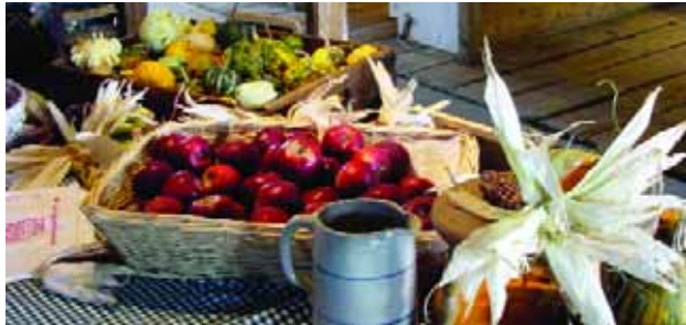
Produce from Berry Patch Farms

Many landowners in Adams County would like to conserve their lands, but do not know how. There are a variety of conservation options available to landowners that enable them to protect their land in a manner that meets their specific needs. Below are brief descriptions of just some of the conservation options available to landowners.