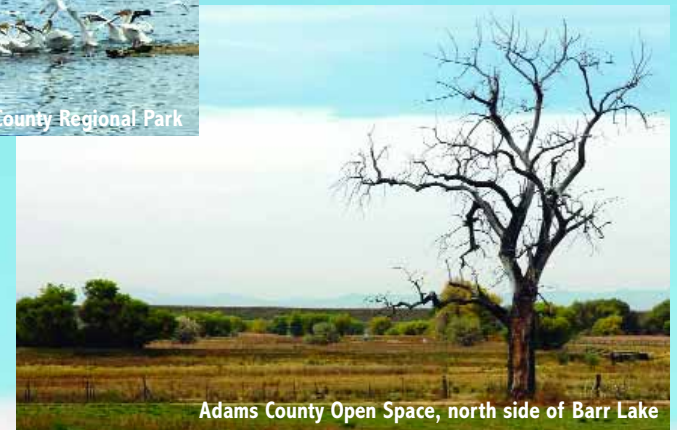
Adams County Open Space, north side of Barr Lake