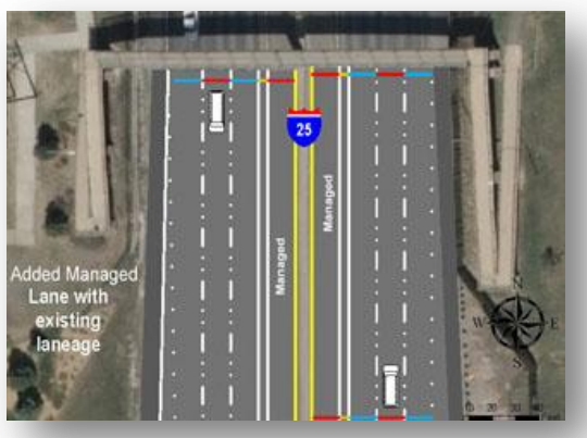
RENDERING OF FUTURE TRAFFIC LANES ON I-25