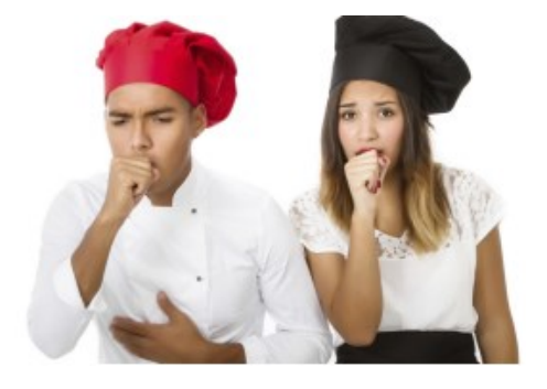
Persistent Coughing and Sneezing