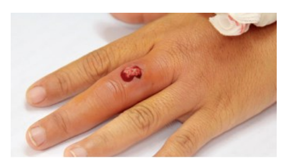
Infected or Open Wounds